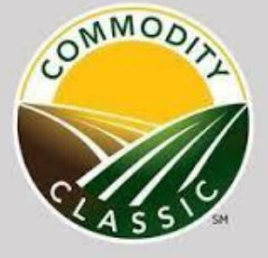
EXHIBIT RIGGING AND HANGING SIGNS INFORMATION

Rigging points at the Orange County Convention Center vary considerably. Rigging of exhibit components, trusses and hanging signs are allowed above 6+ booth spaces only. No hanging or rigging components can exceed the outer boundaries of the exhibit booth's perimeter or the safe loading of the facility ceiling. The maximum height of an island booth at Commodity Classic in the Orange County Convention Center is twenty-two feet, when ceiling height and rigging permit (22' from the floor to the top of any booth components and signs). Suspended truss or rigging hardware used to support signs or lighting is not considered part of the booth and is not factored into the maximum booth height. Signs and/or lighting should not be more than 50% of your booth space in size. Consult Paramount Convention Services for exact maximum dimensions.